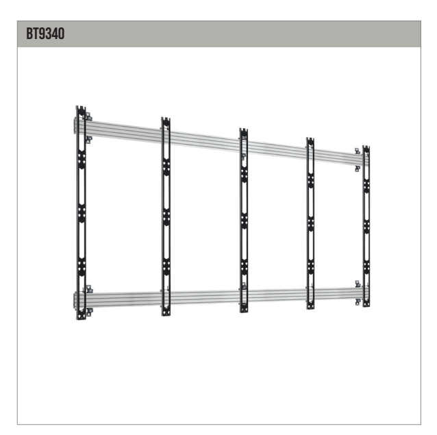
UNIVERSAL DIRECT VIEW LED VIDEOWALL MOUNT