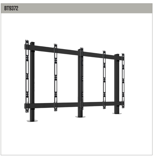
BOLT DOWN UNIVERSAL DIRECT VIEW LED VIDEOWALL STAND