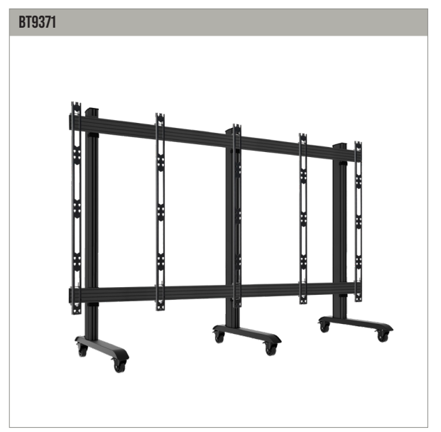
MOBILE UNIVERSAL DIRECT VIEW LED VIDEOWALL STAND