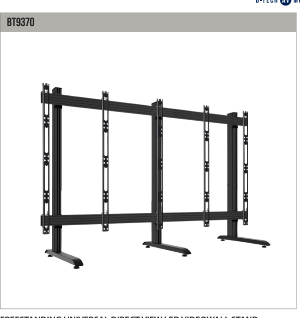
FREESTANDING UNIVERSAL DIRECT VIEW LED VIDEOWALL STAND